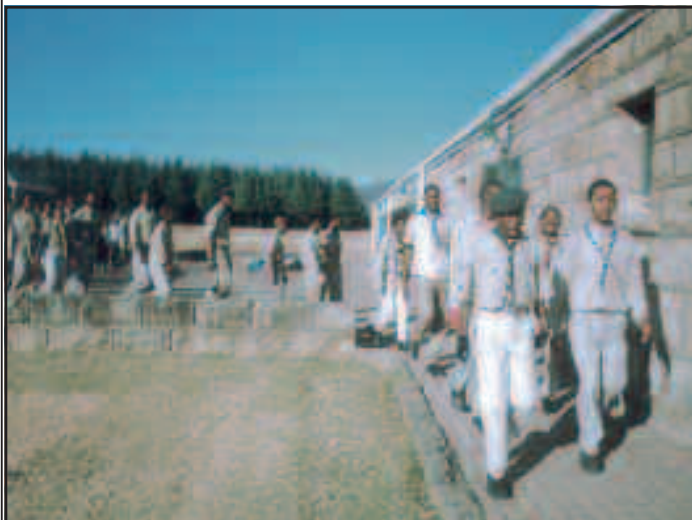
The Troops marching to the Opening Flagbreak of the Camp. Some of the facilities at Khulanathi Educational Centre can be seen.